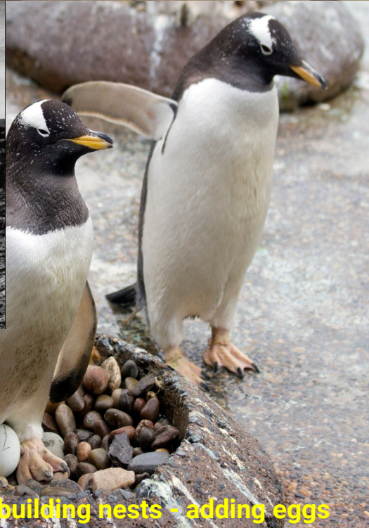
Penguins - building nests - adding eggs