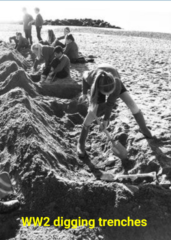
WW2 digging trenches