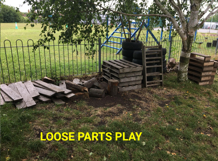
LOOSE PARTS PLAY