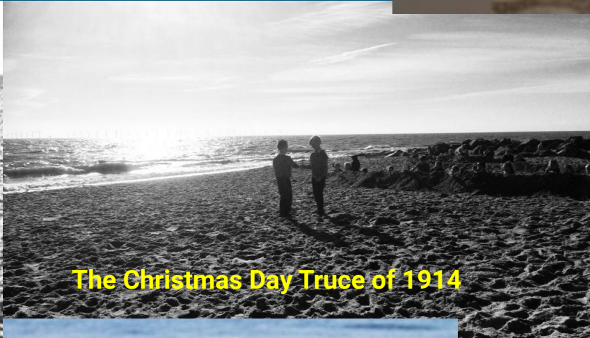
The Christmas Day Truce of 1914