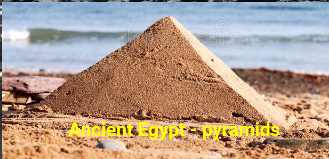
Ancient Egypt - pyramids