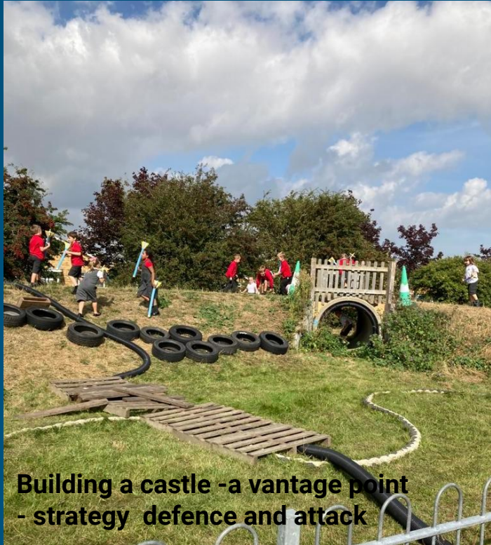
Building a castle - a vantage point - strategy defence and attack

Sport Premium funded - see our sustainable impact in raising physical activity http://www.hollandhavenschool.co.uk/sport-premium.html